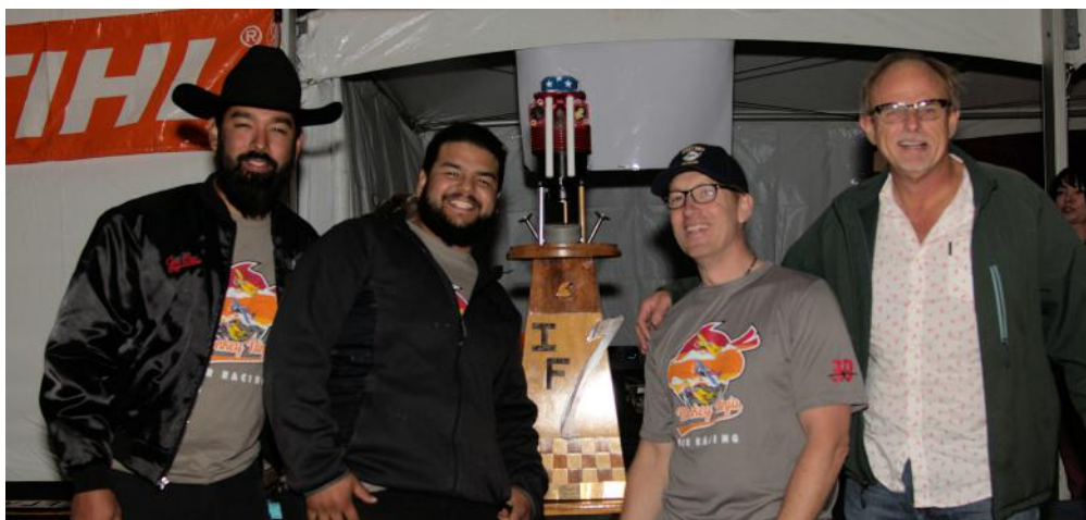
Crew of the Year: Monkey Ninja